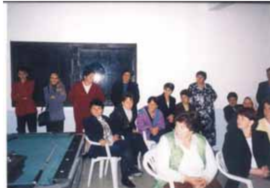
Woman association in East Bosnia.

Humanitarian organization "Snaga Zene" supported establishment of a multiethnic citizens association of women in returnee area of Eastern Bosnia. This would improve the situation of the returnees in general, and create conditions for the members of the association to continue with their work independently and in cooperation with the local authorities. The organization will organize opportunities to educate members of the association in the area of development of civic society and women rights, medical counselling, education in agronomy and fruit cultivation, as well as sewing and crochet.