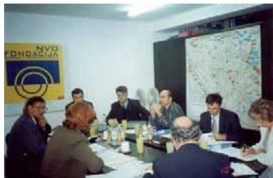
Grants selection committee