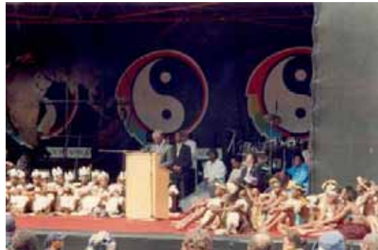
29.08.2001. NGO FORUM, World conference against racism Durban, Južna Afrika.

Very interesting and valuable dialogues were held with two professors of "College of Transfiguration"-Grahamstown and "Western Cape University"-Capetown, about the different praxis, approaches and experiences in conflict resolution and reconciliation, but also with the interest shown in school system functioning in RSA.