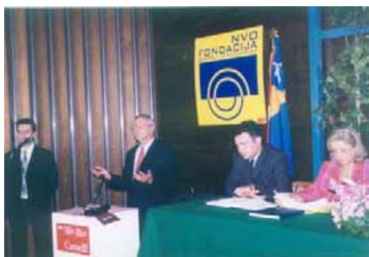
Septembar, 2001. Awarding Ceremony.

Present were representatives of nine NGO partners, Government of Canada (CIDA), Care International, Ministry for Human rights and refugees of Council of Ministers BH, members of Board of Directors of NGO Foundation, guests from other local and international organizations and institutions and staff of NGO Foundation. 50 people in total. Present Media representatives were from "BH radio 1", "Oslobođenje" and "Bosnia Daily"