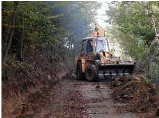
Rebuilding of road to village Komarica.

The main goal of the project is to support the returnee process through reconstruction of the part of local road to returnee area. This project is animating returnees, improves local communications, initiating further initiatives of returnee and rebuilding and organizing returnees on the volunteer base. Project includes the capacity development of the newly founded organization of the returnees "Cer".