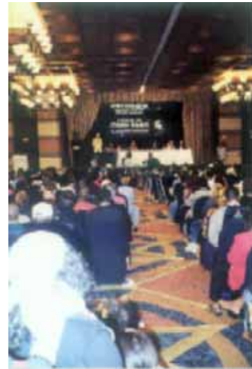
26-28.08.2001. Youth summit, World conference against racism Durban, Južna Afrika.

The other organizations we have visited, such as "Accord", "Idasa" and "Olive" are working on the highest levels of co-operation with the authorities and the creation of the positive changes in different