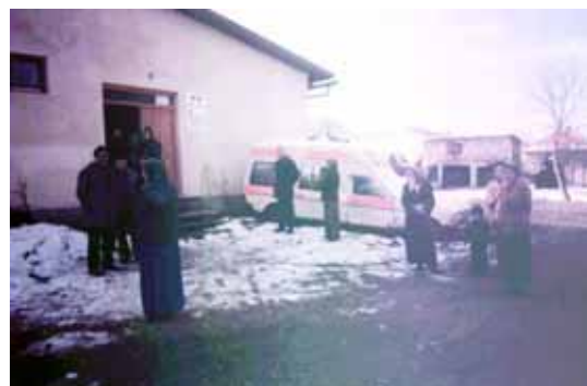
Health care in village Kamenica, Teslić.

The project of Futura Plus has a goal to provide necessary services as well as intervene support for 150 minority returnees in Kamenica. Project will ensure better information flow concerning taxes, credits and business possibilities, so that the returnees could be able to re-build their society and lives in a way that contributes to a long-term reconstruction of their