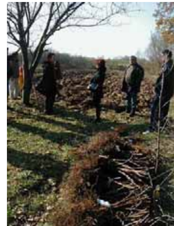
Distribution of raspberries in Gradiška.

This project aims to support economic reintegration of returnees, refugees and local residents through the economic development of the local community, stimulation of agrarian development and creating new jobs. Vidra will achieve this through skill training practice and training of agricultural producers. Project will train 65 households on producing raspberries in three localities (Bosanska Gradiska, Orahova and Dubrave); distribute planting materials for six households that will begin commercial raspberry production; stimulate the reintegration of returnees in the community through connecting the returnee, refugee and local resident populations through their communication and cooperation based on concrete economic foundations.