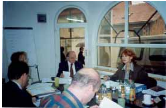
Grants selection committee