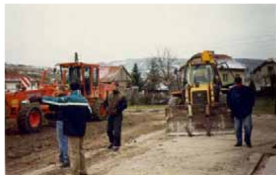
Work on the sport field in village Haljinići, Kakanj.

This NGO thinks that secure and friendly surrounding and trust building will lead to creation of better conditions for life. Through this project the organisations aims to improve living conditions of 100 members of cultural-sports association "Haljinići". This association was formed as an initiative of returnees and 40 members of cultural and arts association "Queen Katarina" Čatići and their mission are to protect the tradition of Croats in this region. Different activities will encourage the returnees to initiate and lead public champagne to support sustainable return.