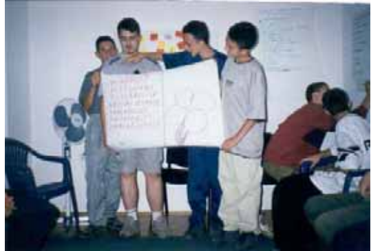
Workshop of non-conflict communication, youth.

This Board is supposed not only to represent citizens needs but also to establish contacts with local authority. During the project implementation the Board will make their own program of work and activities, all based on citizens needs. These citizens will be given a chance to express their concerns during the public tribune that is part of the project. During the project period the Board will also lobby local authorities for solving certain problems, defined as community priorities