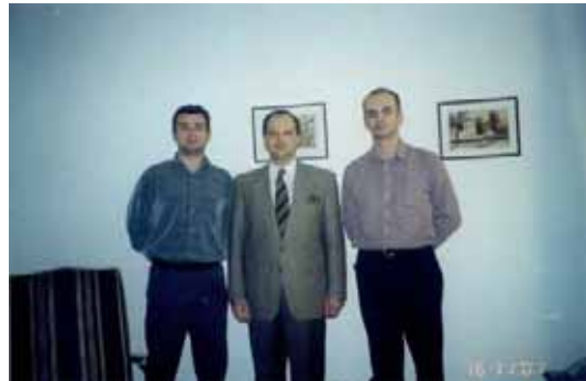
Director of NGO Foundation and representative of CCI Banja Luka visited Bosnian embassy in USA.