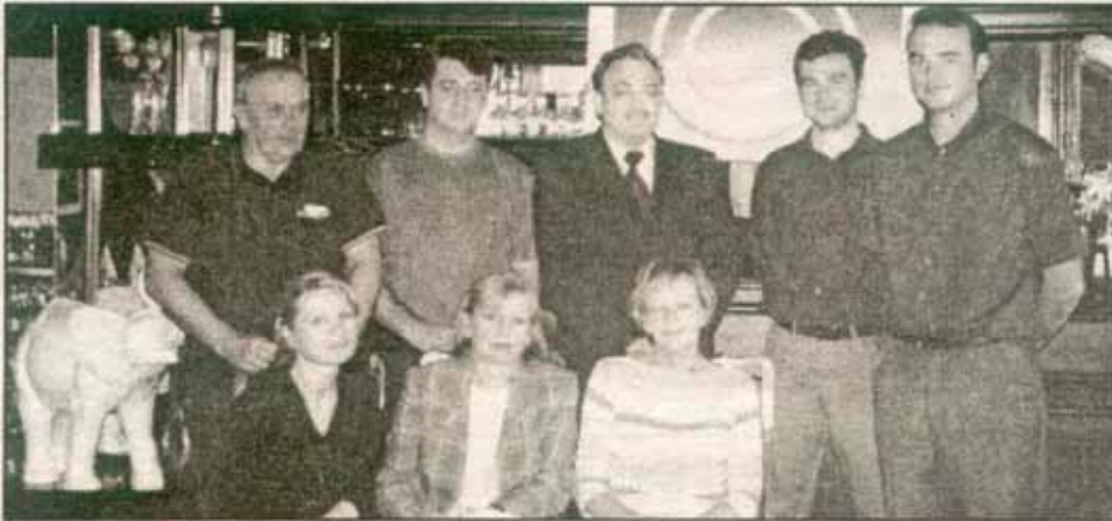
Upravni odbor Fondacije: Pomoć nevladinim organizacijama