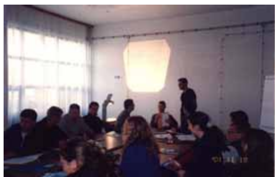
Workshop with youth representatives from Prozor.

This project aims to assist young returnees through development and strengthening of youth organizations and informal groups of young people in Jablanica, Konjic and Prozor-Rama. Project will initiate social activities in area of Jablanica, Konjic and Prozor-Rama, involve 100 young people, train 30 young people on small business development and will educate 24 volunteers on running of social activities.